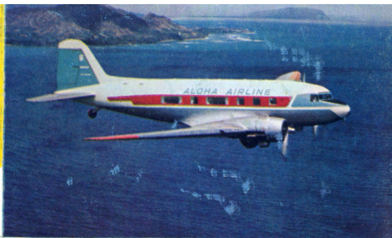
Panoramic Window Vistaliner

FULL-COLOR MAP. The cartographic map inside this folder pictures for you the major islands of Hawaii. Make this your souvenir map of your Aloha Airline tour.